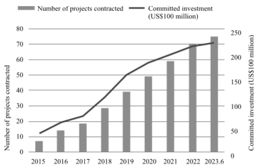
Figure 3: Number of projects contracted and committed investment by the Silk Road Fund since 2015

The CDB and the Export-Import Bank of China (China Eximbank) have each set up special loans for the BRI to pool resources to increase financing support for BRI cooperation. By the end of 2022, the CDB has provided direct high-quality financial services for more than 1,300 BRI projects, playing a leading role in guiding development finance, and pooling all kinds of domestic and foreign funds for BRI cooperation. The balance of loans of China Eximbank for BRI projects reached RMB2.2 trillion, covering 130-plus participating countries and driving more than US$400 billion of investment and more than US$2 trillion of trade. China Export & Credit Insurance Corporation has fully applied export credit insurance and actively provided comprehensive guarantees for building the Belt and Road.